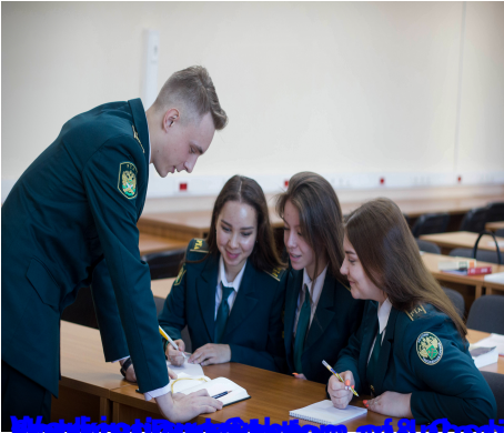
Methods of Work and Grading of Goods