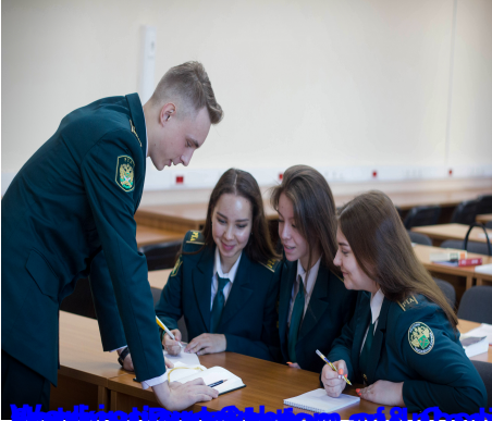
Marketing of Items and Goods of Goods